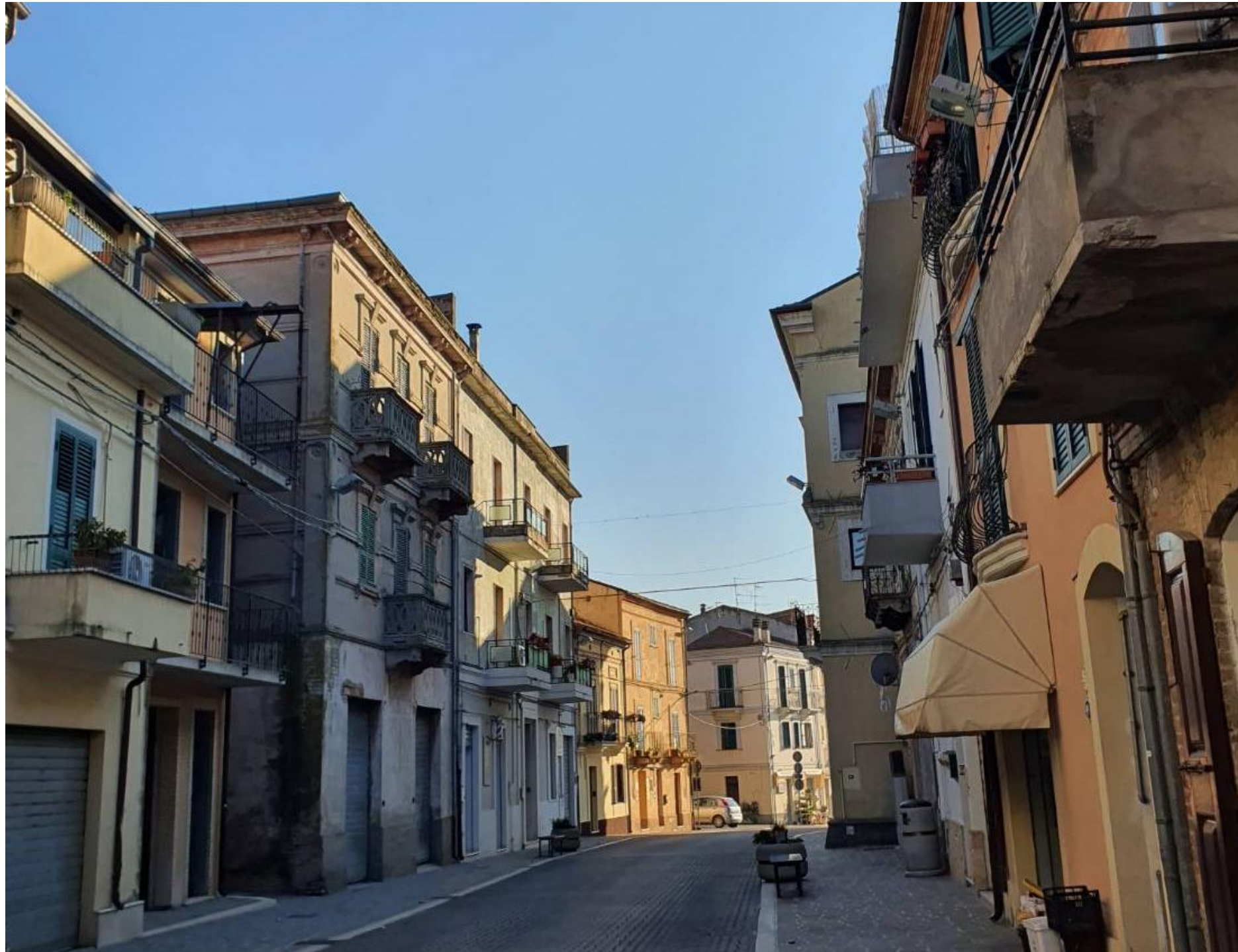
Paglieta (CH) , Italy

I like people in this city because they are very friendly. When I go for a walk you can see someone you don't know who says "Ciao!!" and smiles to you.