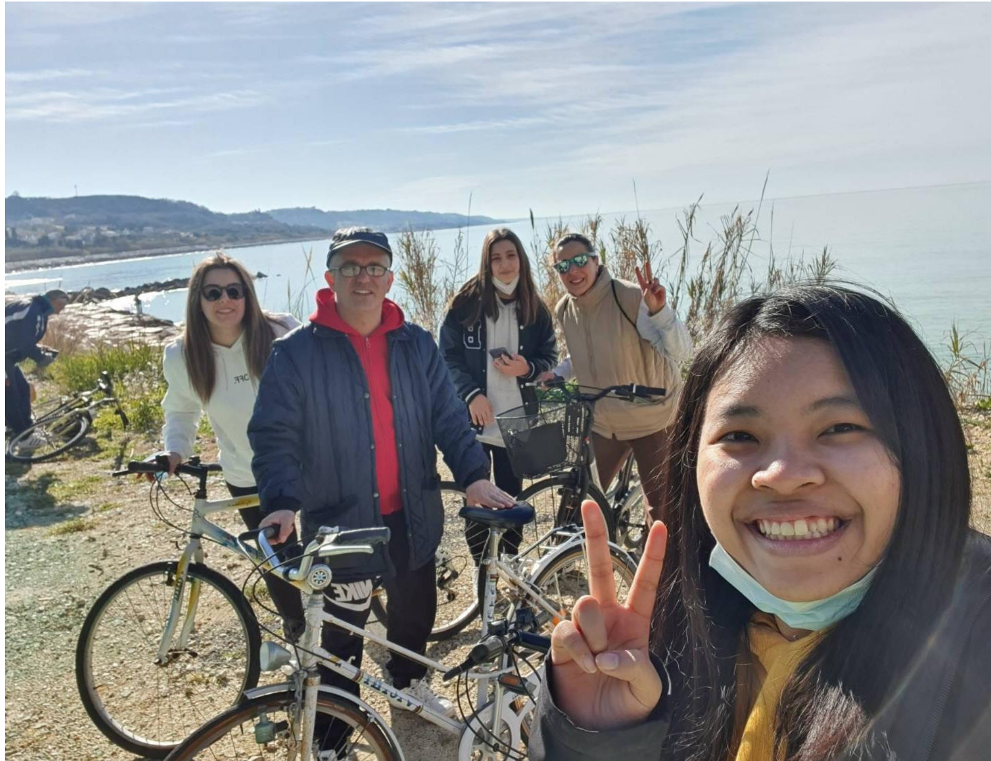
San Vito Chietino

When I go back to Thailand I will get the skill of living with others, good relationship with friends, a host family and Italian language.